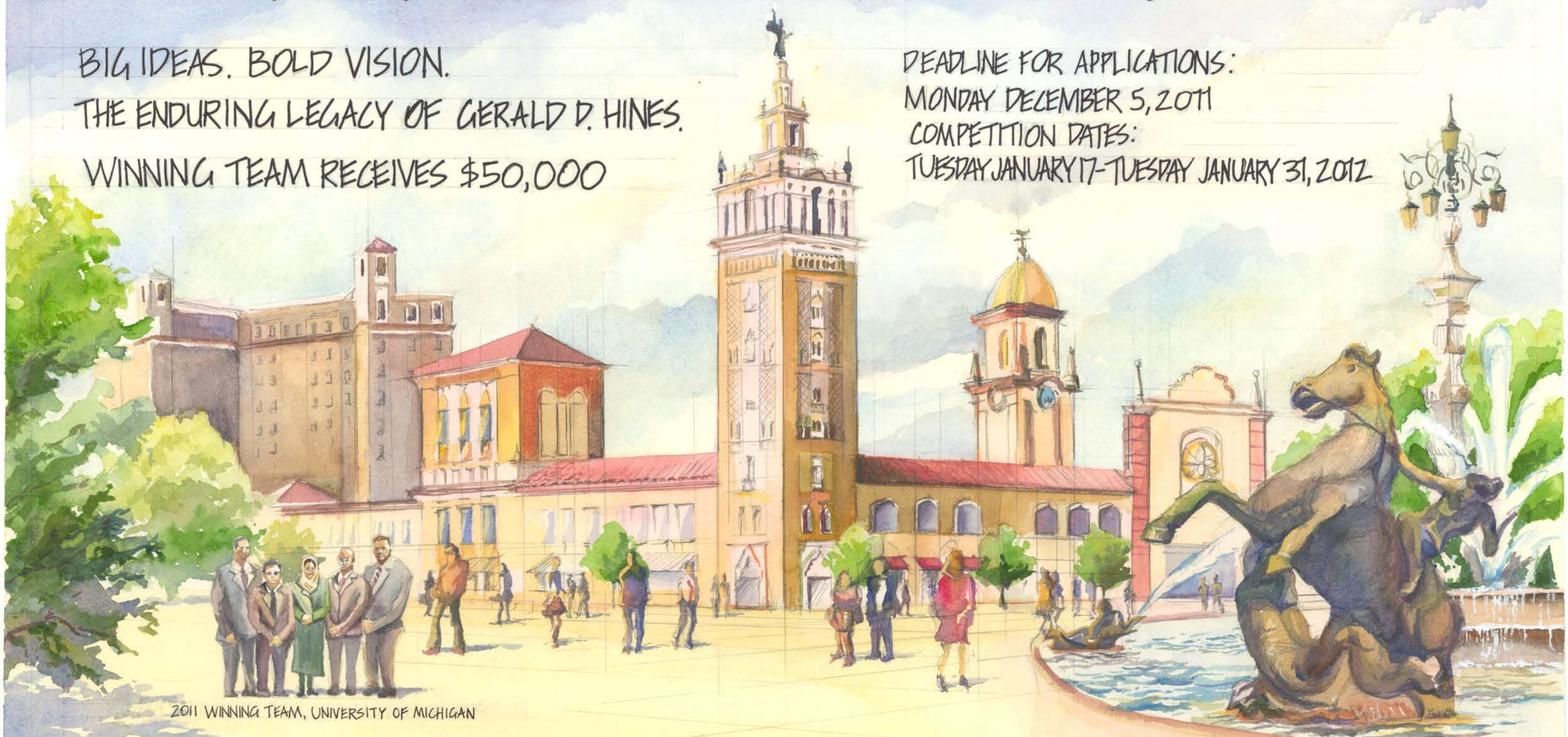
2011 WINNING TEAM, UNIVERSITY OF MICHIGAN

DEADLINE FOR APPLICATIONS: MONDAY DECEMBER 5, 2011 COMPETITION DATES: TUESDAY JANUARY 17 - TUESDAY JANUARY 31, 2012